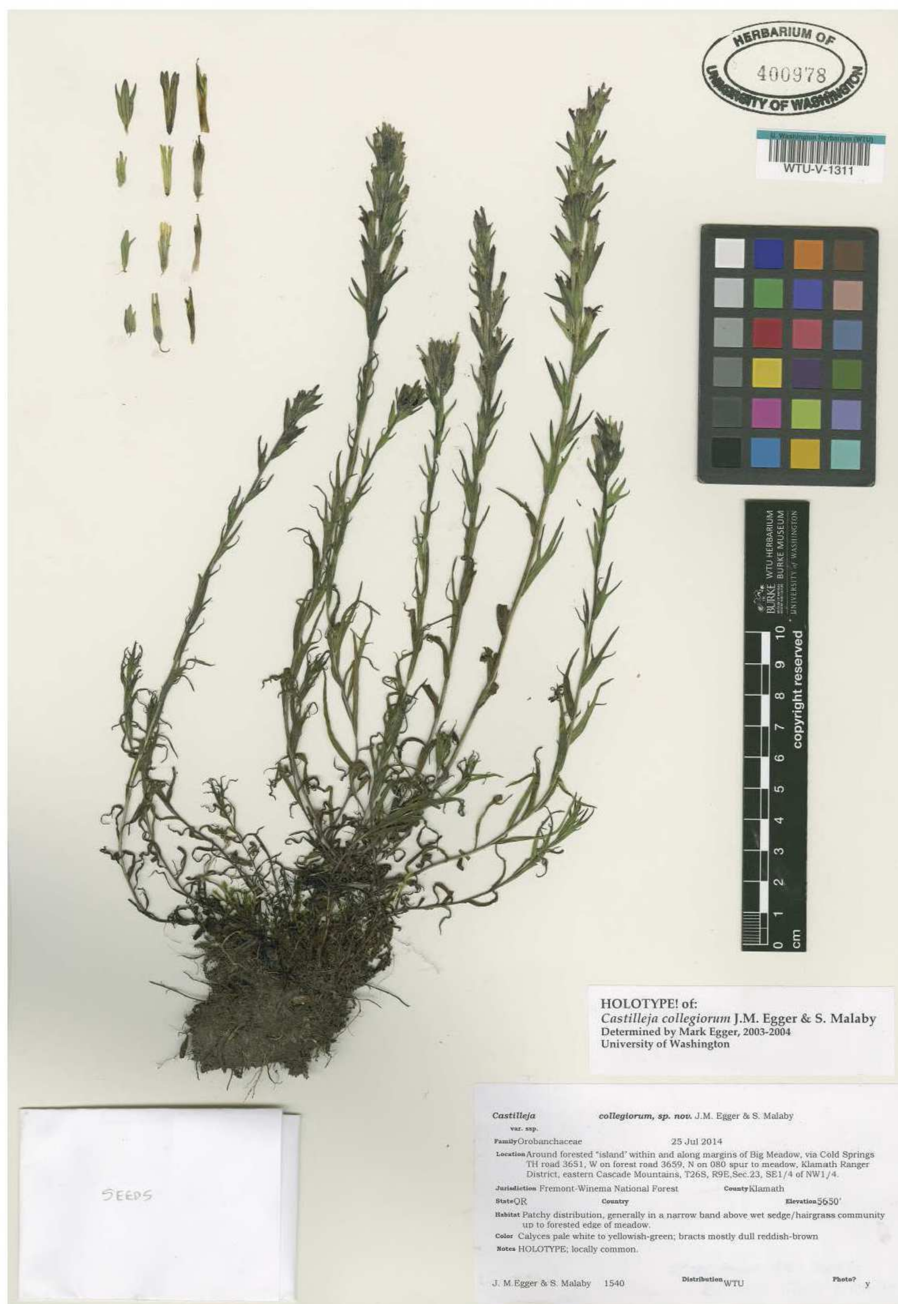
Figure 2. Holotype of Castilleja collegiorum , WTU.